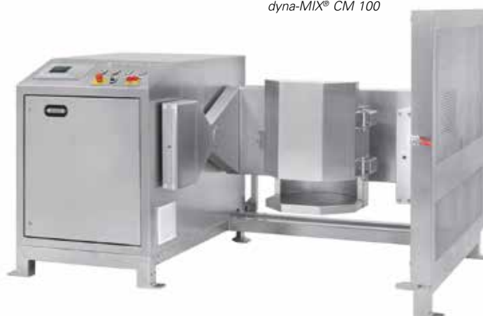
dyna-MIX® CM 100

The dyna-MIX® equipment is designed for middle to large scale production with container volumes from 40 to 1200 litres.