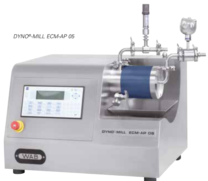
DYNO®-MILL ECM-AP 05

If your product is sensitive to heat, is high in viscosity, or has a tendency to foam – the DYNO®-MILL ECM-AP 05 high-efficiency mill will achieve the desired results in a short run.