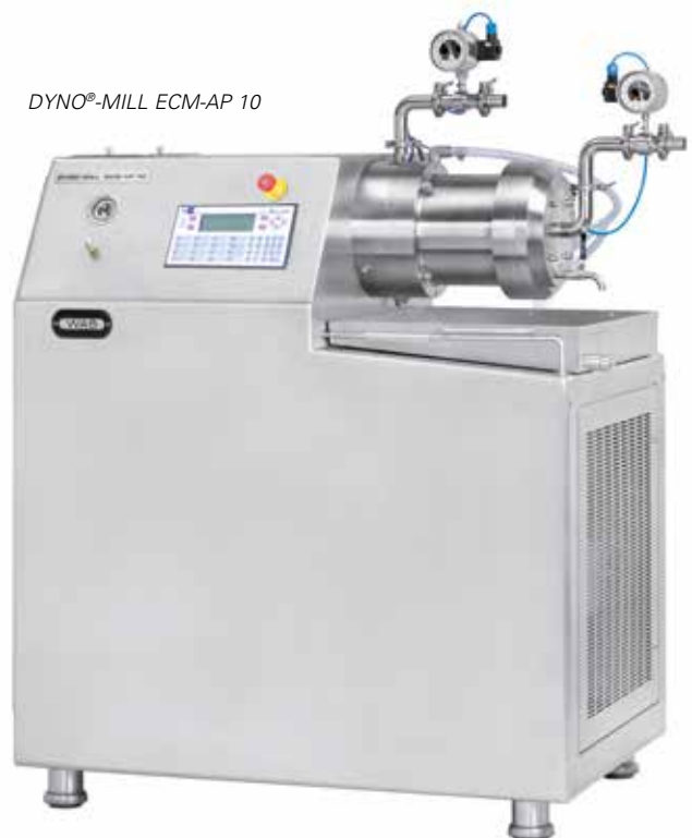
DYNO®-MILL ECM-AP 10

The ability to change the process parameters in a wide range enables to fine-tune the process for a broad spectrum of products to achieve narrowest particle size distributions and full reproducibility.