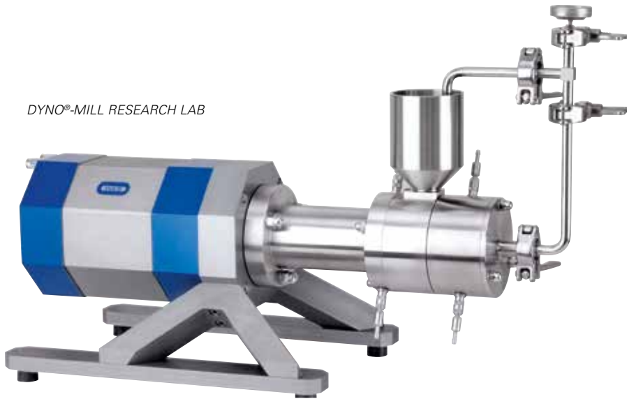
DYNO®-MILL RESEARCH LAB

For over 50 years, WAB has been a leader in the field of wet micromedia milling with thousands of the famous DYNO®-MILL agitator bead mills installed worldwide.